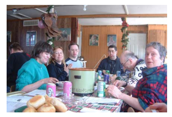
Sleigh ride and chili feast, February 2005

We, at the Familyhome Program, are always on the lookout for opportunities and prepared to invest the time necessary to see the most promising of these through to fruition. Also, we view the various components of the Familyhome program as being a valuable resource. With this in mind, we are planning to meet several times during the year both, to plan and take part in fun activities, in addition to sessions to address serious agenda items.