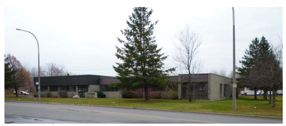
New building located at 229 Colonnade Road

It is a single storey building, which is located right next to a City park, providing ample green space for client and staff activities. We will have ample parking and easy access for Para-Transpo vehicles. We have also been advised. bv Councillor Gordon Hunter of the City of Ottawa, that there is a