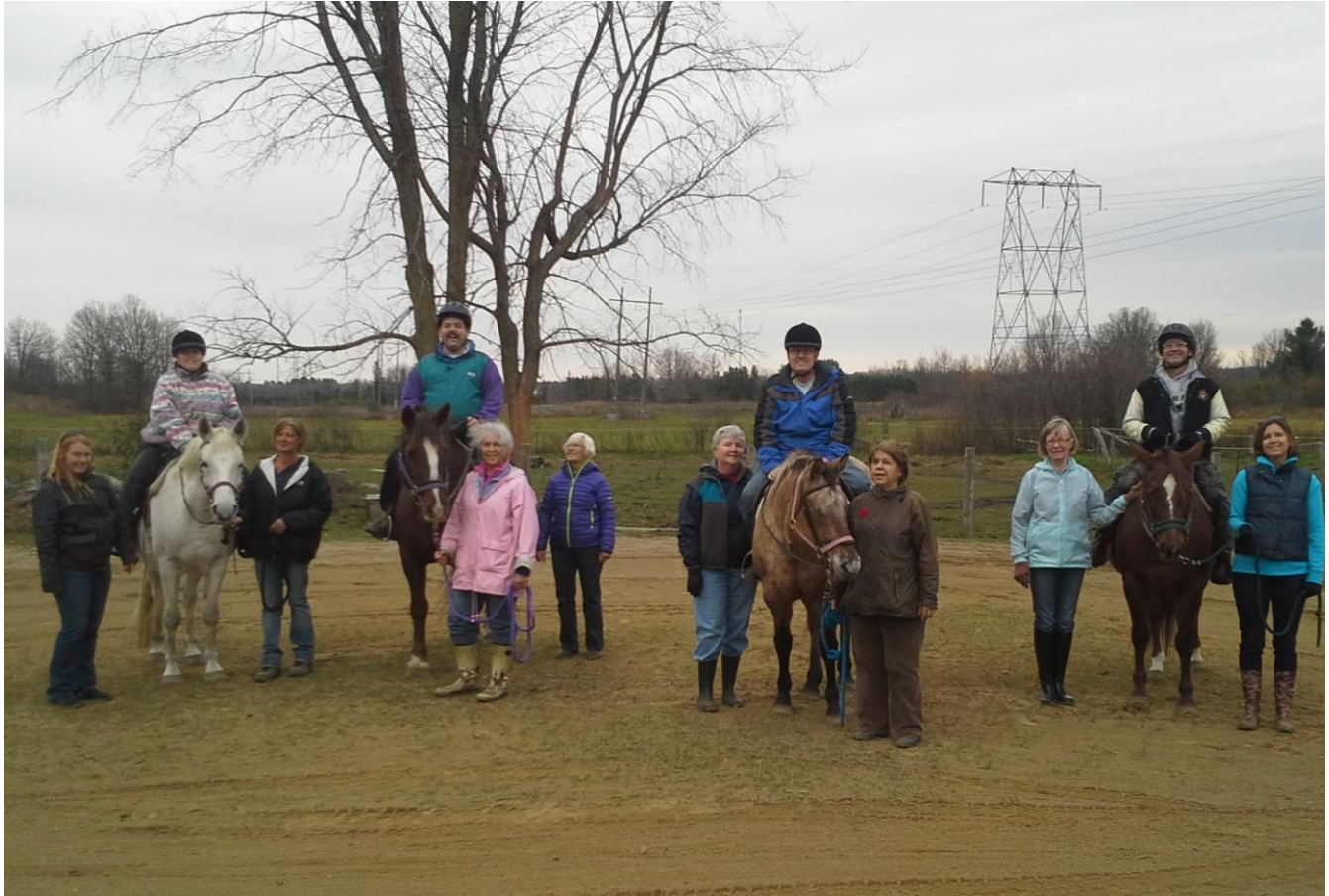
The riders and volunteers.

For many years OCAPDD individuals have enjoyed the therapeutic riding program but this past year was a very special session. First the program was split into two groups last spring, horsemanship for individuals who are unable to ride and the therapeutic riding program for those who can ride.