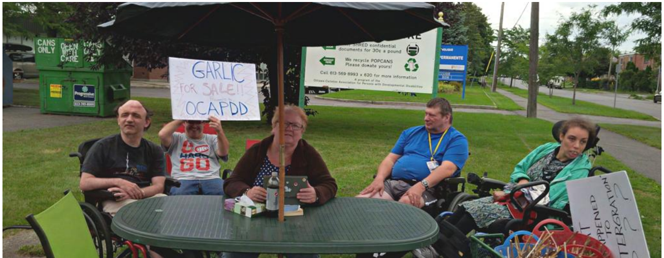
This year Silver Spring Farm tried a new satellite location at the Loeb Centre. What a success it was. Staff and individuals rallied together and in short order put a team together and sold just over $800. Great teamwork!