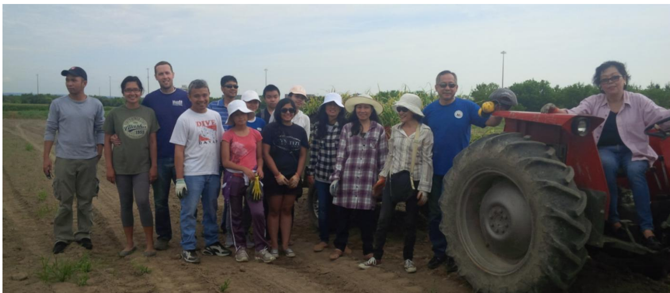
A group from the Embassy of the Phillipines helping to harvest the garlic.