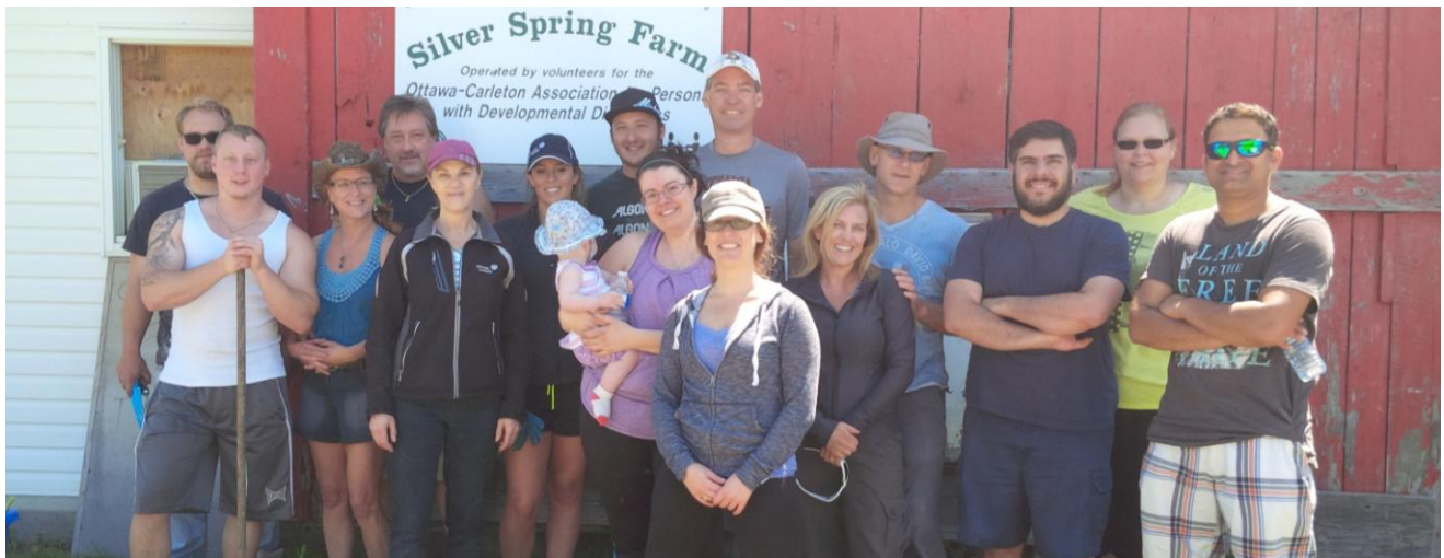
Johnson Controls weeding the garlic.