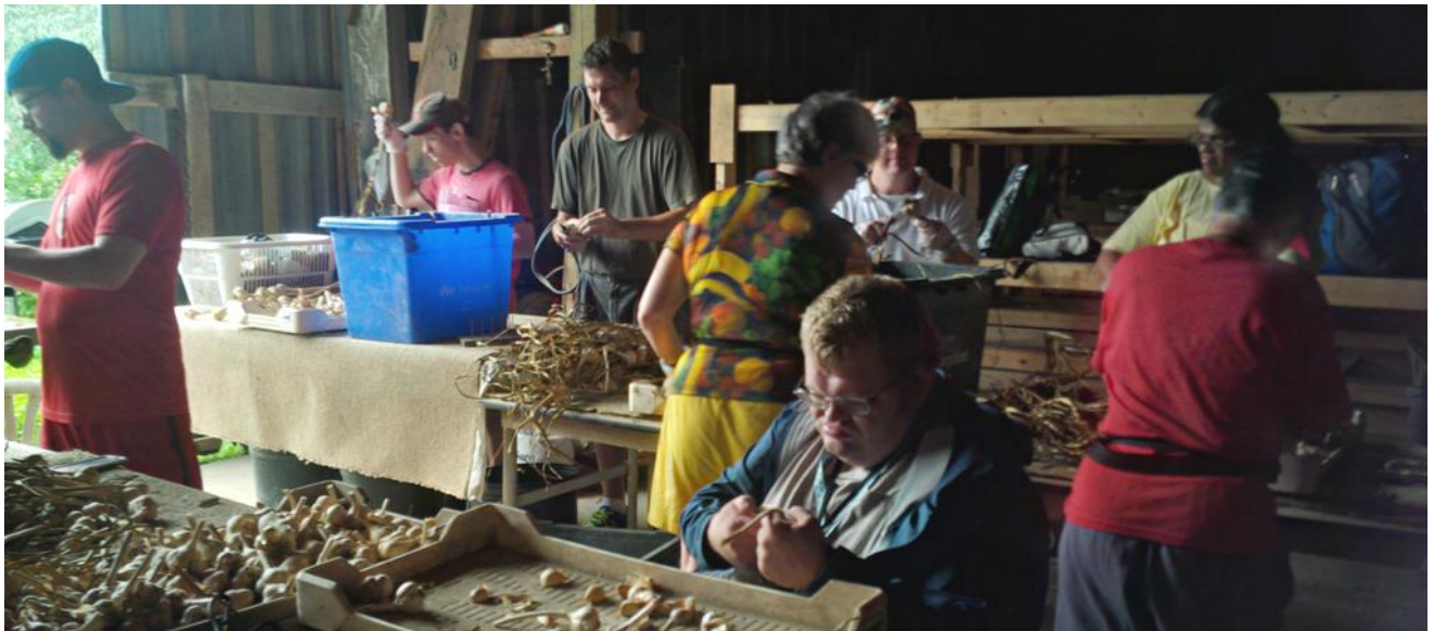
Individuals from Plant Maintenance joined the garlic team to help out with the cleaning, sorting and splitting of the garlic.