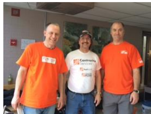
Employees from Home Depot Baseline.