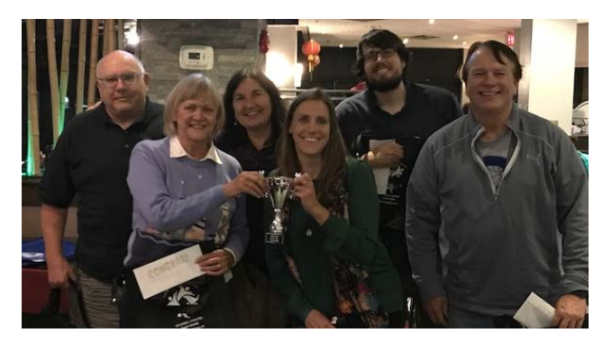
The Monagham Family