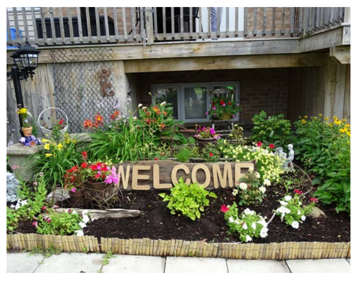
The Sydney Program was the overall winner!

This contest proves that we understand this concept and take pride in having a yard and curb appeal that is inviting and beautiful for people to enjoy! I am confident that people will stop to admire your work and start a conversation. Starting a conversation is the first step to developing relationships.