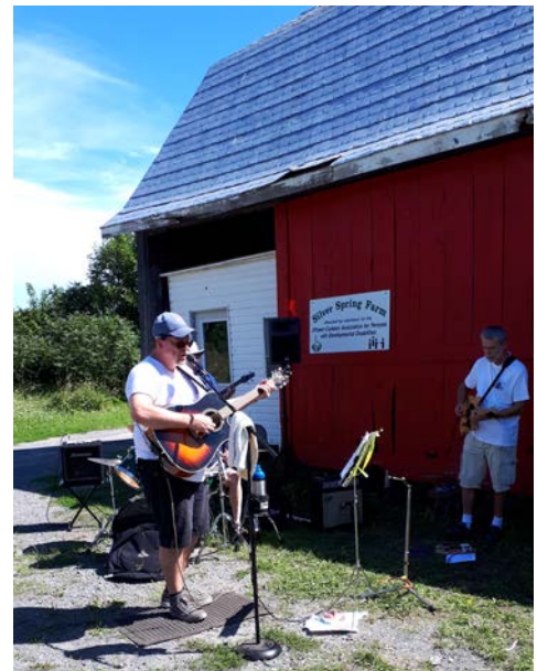
Freight and Cargo Country Band.