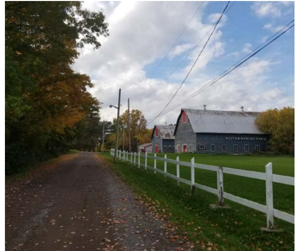
A nice fall day at Silver Spring Farm.

The Photo is not intended to be a portrait