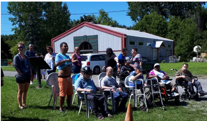
Everyone enjoying the Freight and Cargo Country Band at Silver Spring Farm on Saturday, August 11 th .