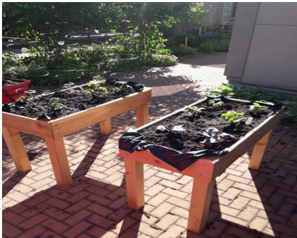
The results of the donated garden/herb boxes. A huge thank you from the residents and staff at Charette!