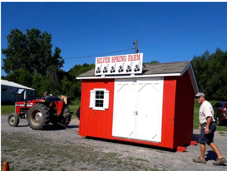
Silver Spring Farm's little red shed is on the move to sell garlic. A big thank you to Fred Pelley!