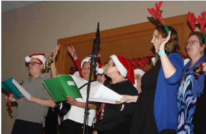
The Glee Club.