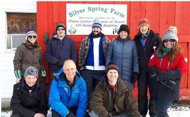
Big shout out to our volunteers from Health Canada and the community who came out and placed the straw in the field.